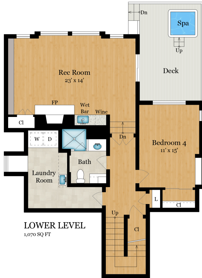
LOWER LEVEL 1,070 SQ FT